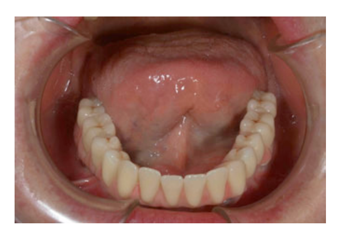
Fig. 4. Intra-oral view, framework is cemented to abutments.

subjected to variable efficacy [28], cause more stress to patients and have longer rehabilitation period.