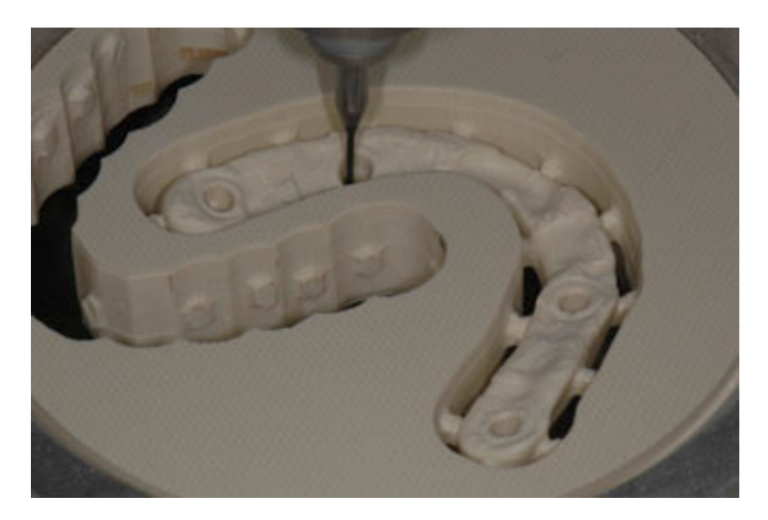
Fig. 3. Fiber-composit disk during milling process. After the digital design, the project is realized through a milling machine.

The first difference from conventional methods is that this procedure limits the indications for bone graft or regeneration, thus using the residual native bone. This is important because horizontal and vertical bone augmentation procedures are