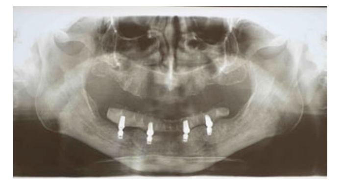
Fig. 5. Radiographical evaluation, note the subcrestal position of implants, the metal-free substructure with denture theet in position. The opposite dentition in this patient was a complete removable denture.

Another difference concerns bio-tolerability. The reference material (metal alloy) is used despite a lack of robust clinical tolerance studies [36]. Corrosion represents a concrete risk, as cobalt and nickel are released into the oral cavity [37–40], and long-term effects have not yet been fully discovered [1,37,41,42]. The use of a metal-free prosthesis may solve the problems related