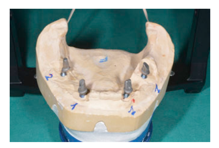
Fig. 2. Stone model with milled abutments. The parallel milling is necessary to achieve a passive fitting of prosthesis.

cantilever extension of 21.0 mm. The project is realized using a milling machine operating on five axes (Roland DWX-50). The machine uses diamond-hardened drills and works at 1 and 2 mm to 16,000 rpm for the roughing stage and up to 25,000 rpm in the finishing stage (Fig. 3).